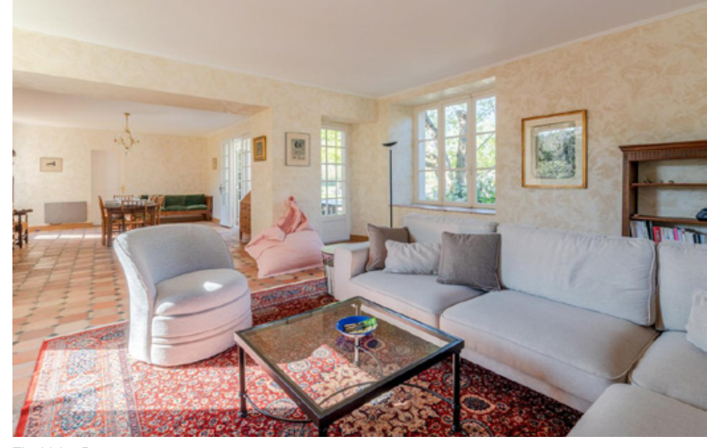
The Living Room